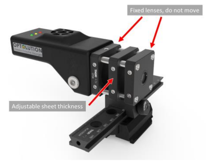
Figure 4: Light sheet optics.

The light sheet optics consists of several elements: The cylindrical lens must not be rotated. If you need to rotate the light sheet, then rotate the whole laser, not the cylindrical lens. To adjust the sheet thickness and focus distance, move the central lens element. Keep the optics free from dust, otherwise the lenses might be damaged. Installing a bandpass filter (450 nm \pm 40 nm) in the camera is highly recommended, as the exposure of the camera is longer than the laser pulses.