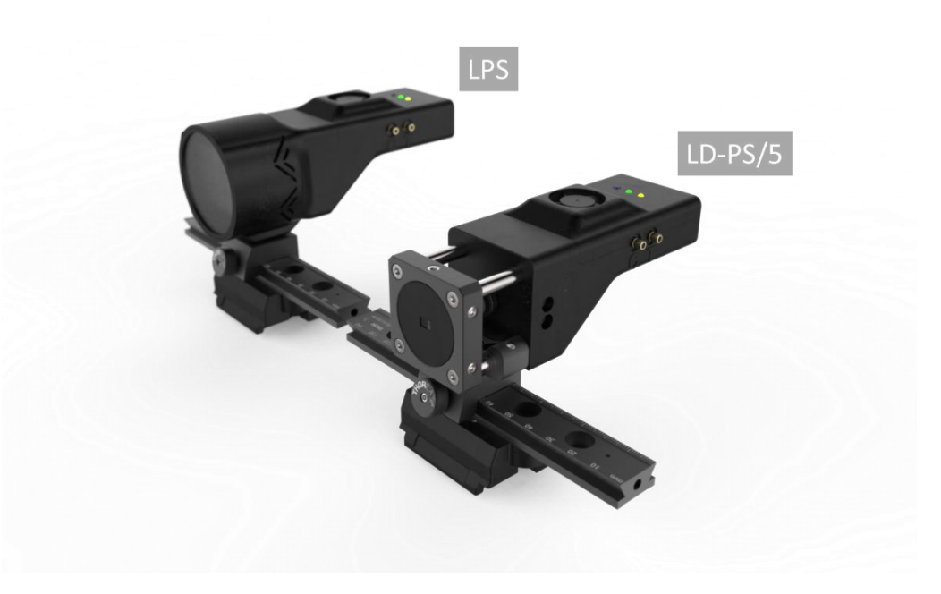
Figure 1:The LPS (using a LED array) and the LD-PS/5 (using a laser diode).