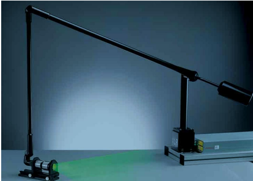
Bench-mounted light sheet illumination system including mini laser, mirror arm and light sheet optics.

The articulated mirror arm is an integrated light guide for delivering controlled laser illumination to the measurement plane in PIV experiments. This beam delivery solution is particularly effective in cases when the laser needs to be kept away from the experiment due to space constraints or hostile conditions.