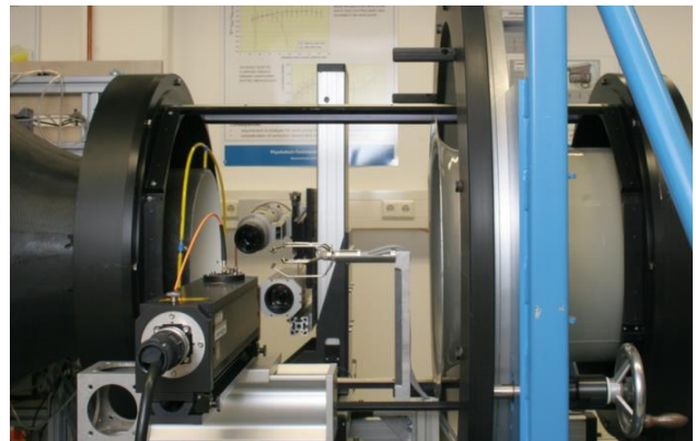
Fig.2: Sensor calibration with ILA LDV System at PTB (NMI Germany)