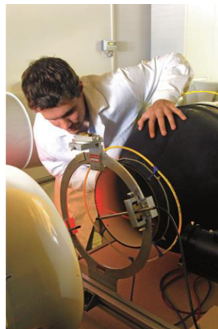
Fig.3: E+E Elektronik, Austria